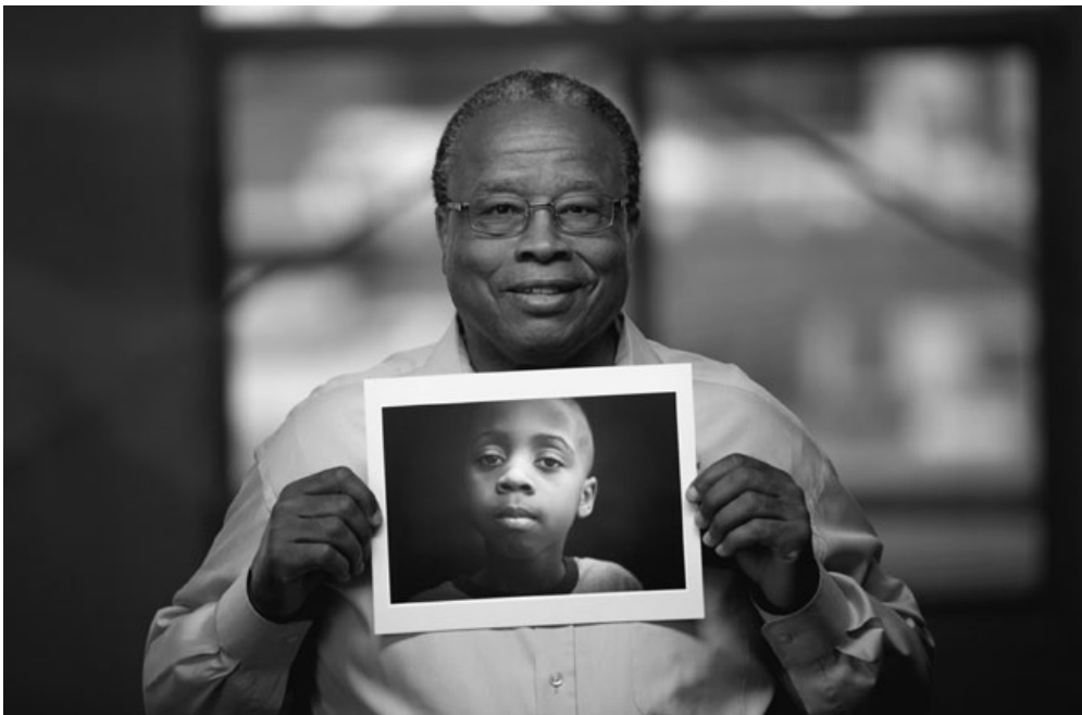
I am for the child.

The children/youth participating in these conversations seemed to picture their GAL volunteer as a friend, mentor, counselor, teacher, advocate, supporter, and cheerleader. This Initiative realizes two outcomes: (1) it documents the success of the Guardian ad Litem Program and the work of its volunteers and (2) it also provides the opportunity for children in foster care to guide the direction of the Guardian ad Litem Program and to improve the organization’s ability to meet the child(ren)’s needs.